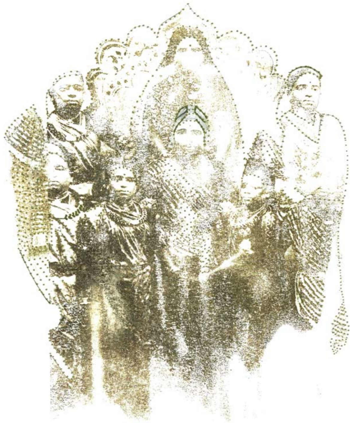
Unique/One of A Kind Mixed Media on Paper 13" X 19"