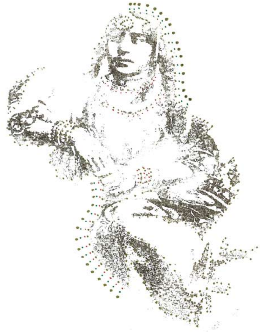
Unique/One of A Kind Mixed Media on Paper 13" X 19"